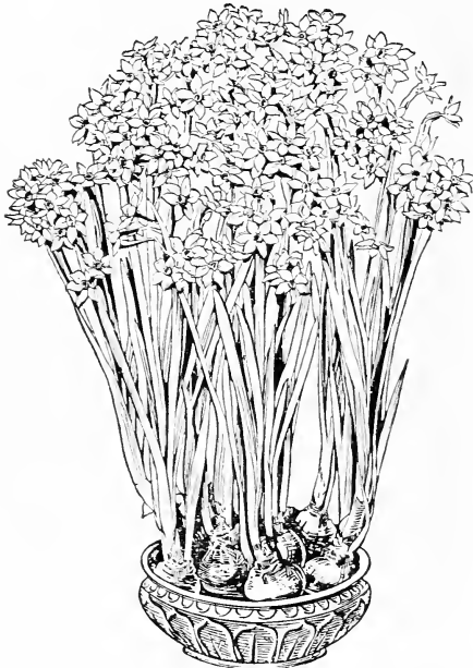
Narcissus—PAPER WHITE GRANDIFLORA Showing a made-up bowl growing in water